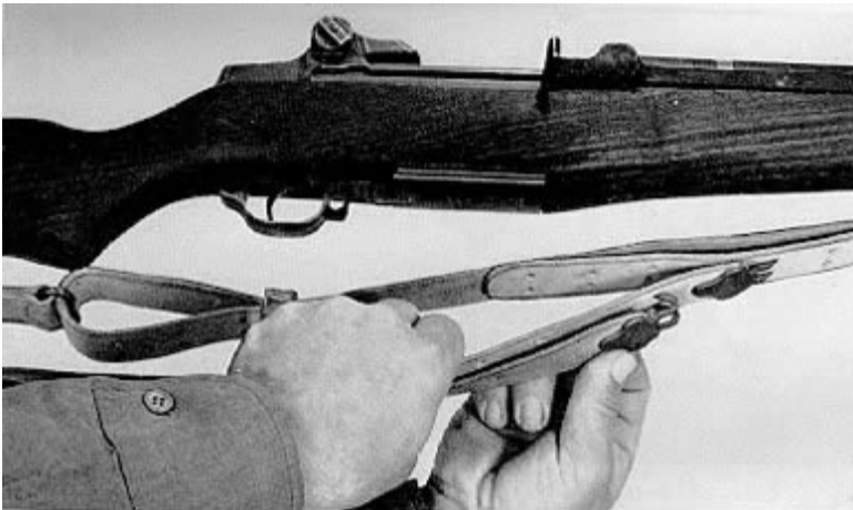
Figure 3: Attaching the M1907 Sling to the Rifle

1. Thread the feed end of the long strap through the upper keeper as shown in figure 3; then place the upper hook in the third or fourth pair of holes near the feed end of the long strap. Engage the lower hook in the pair of holes below the upper hook. The sling is now attached to the rifle.