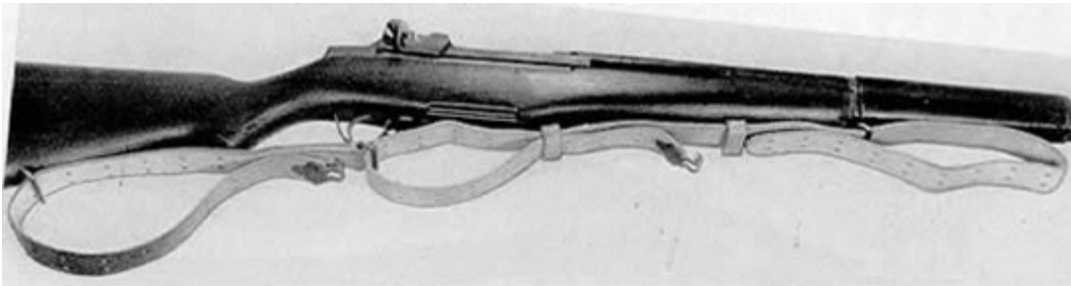
Figure 2: The M1907 Sling on the Rifle

1. Thread the feed end of the long strap through the upper keeper as shown in figure 3; then place the upper hook in the third or fourth pair of holes near the feed end of the long strap. Engage the lower hook in the pair of holes below the upper hook. The sling is now attached to the rifle.